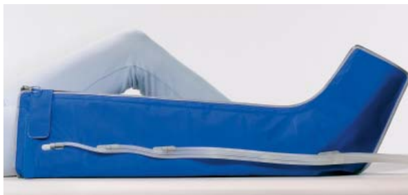
leg sleeve with 6 air chambers full-length zip, Velcro fastening Size M: thigh circumference 70 cm, length 85 cm Size L: thigh circumference 83 cm, length 85 cm

The full-length zip facilitates fitting and cleaning. An additional Velcro fastening allows an optimal adjustment to the thigh.