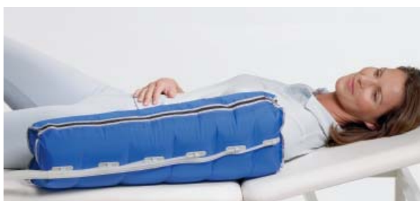
arm sleeve with 6 air chambers full-length zip upper arm circumference up to 60 cm, length 67 cm