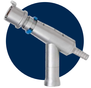
Angled Shaver Handpiece

A wide selection of shaver blades will soon be available as well. For further information please contact the Nouvag sales representative of your country.